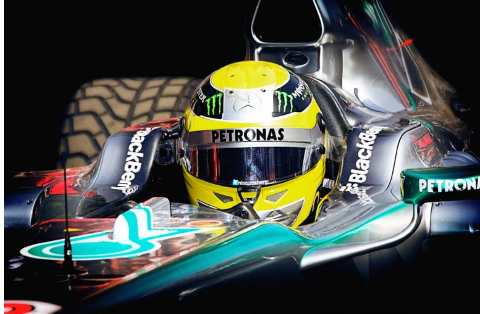
Goodwood Festival of Speed 2013. Above: Nico Rosberg. Below: Sebastian Buemi – Redbull F1 (both Canon 1DX with Canon EF 70-200mm f2.8 L IS II USM).